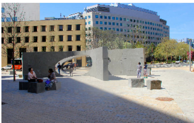
Image of Collier Memorial.