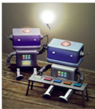
6.438 Algorithms for Inference