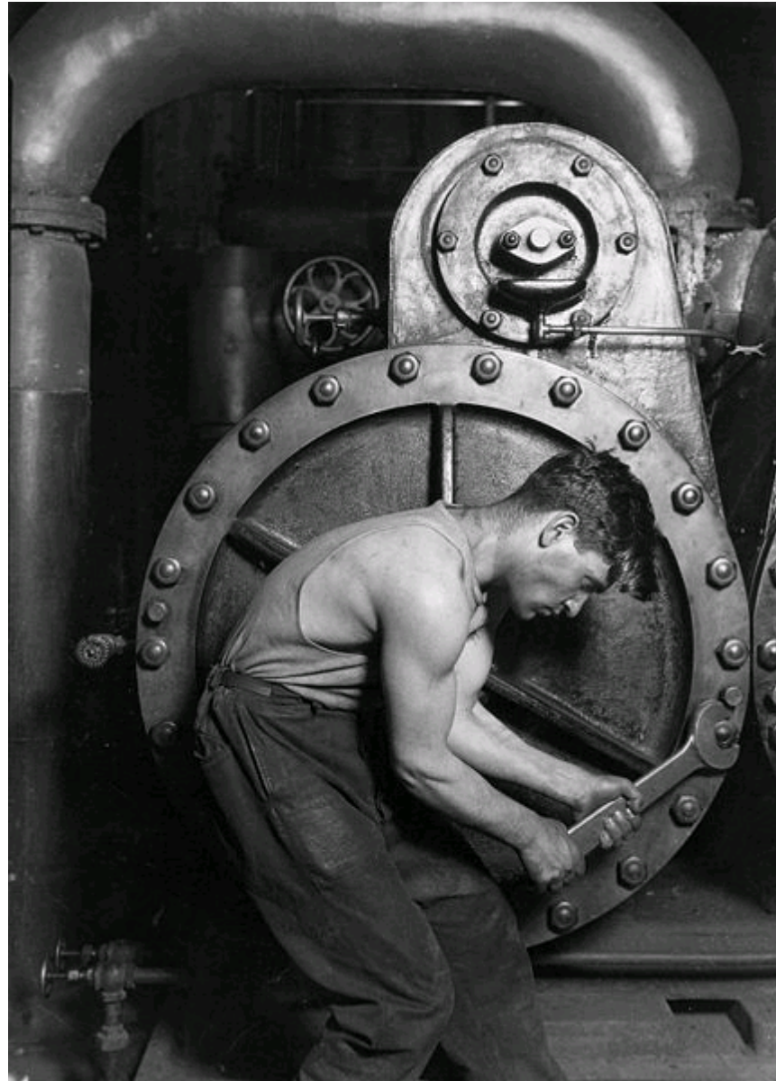
Lewis Hine, Power house mechanic working on steam pump , 1920.