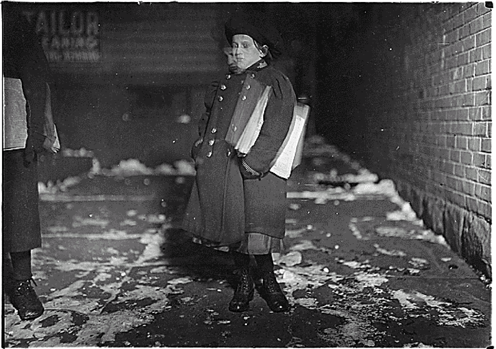
A nine year old newsgirl. She sold later than 8 P.M. sometimes. Been selling two years. Hartford, CT. March 6, 1909.