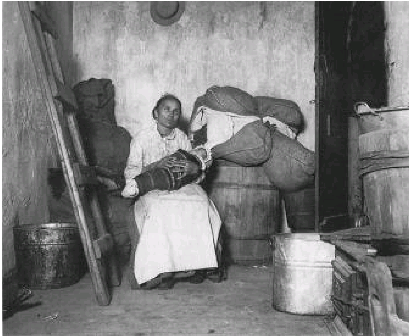
Jacob Riis, In the home of an Italian rag-picker, Jersey Street, ca. 1890. From How the Other Half Lives: Studies Among the Tenements of New York. New York, NY: Scribner, 1901.