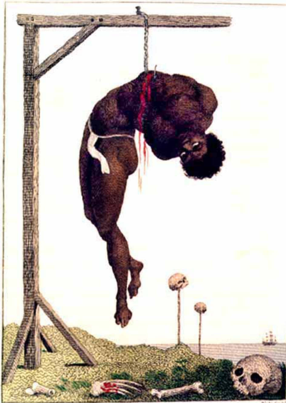
“A Negro Hung Alive by the Ribs to a Gallows.” Drawing by William Blake, 1796.