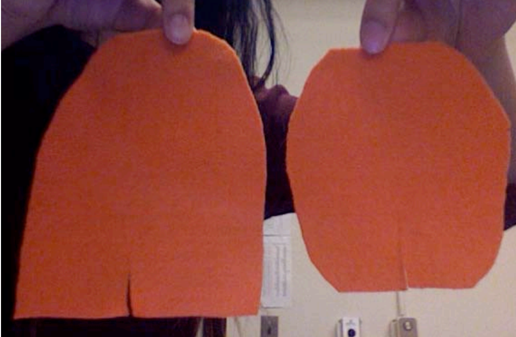
Cloth patterns for the deflectors.

Manufacturers have to be careful when placing the magnet (or suction cup) because slight variations can significantly change the angle of the deflector. If the angle is off, it might become uncomfortable or ineffective at deflecting fog.