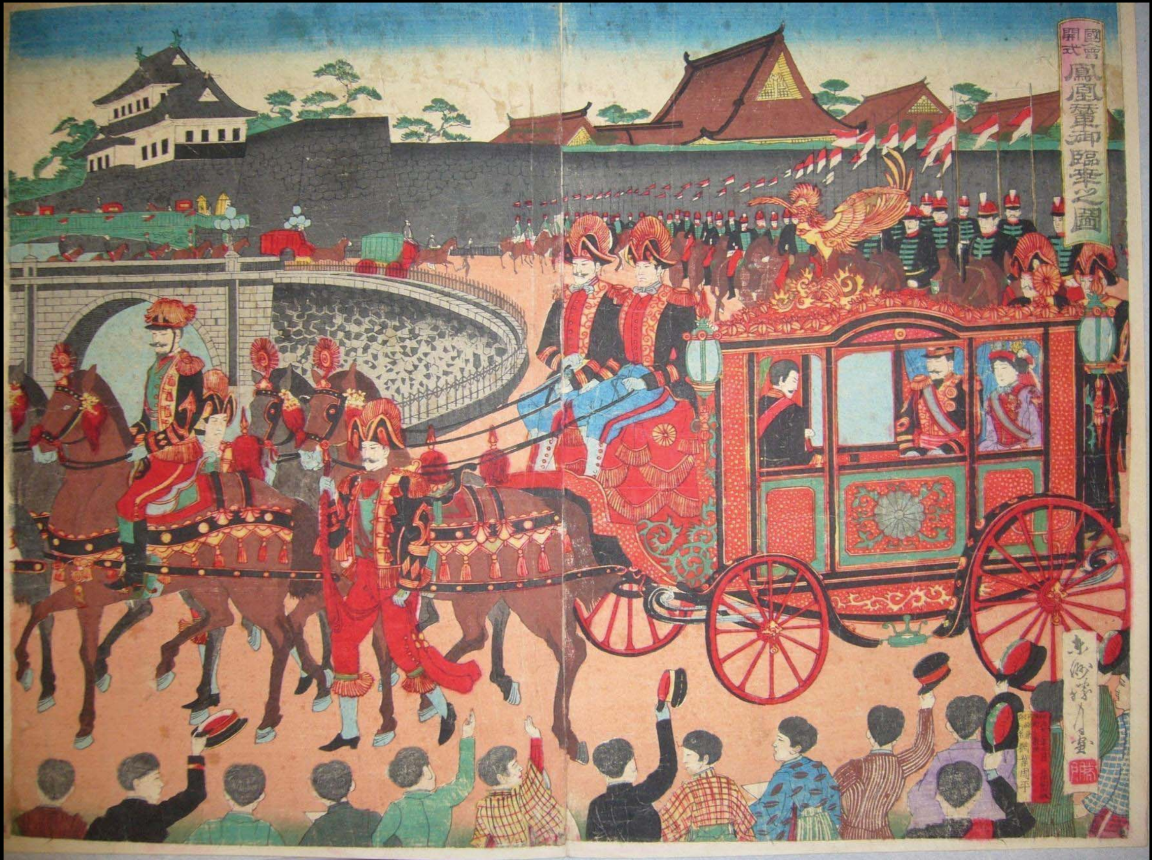
This image is in the public domain.