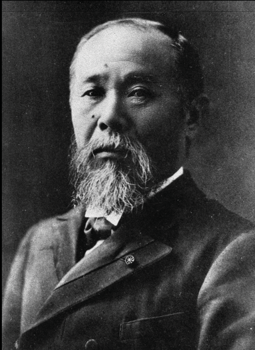
This image is in the public domain. Source: Wikimedia Commons .