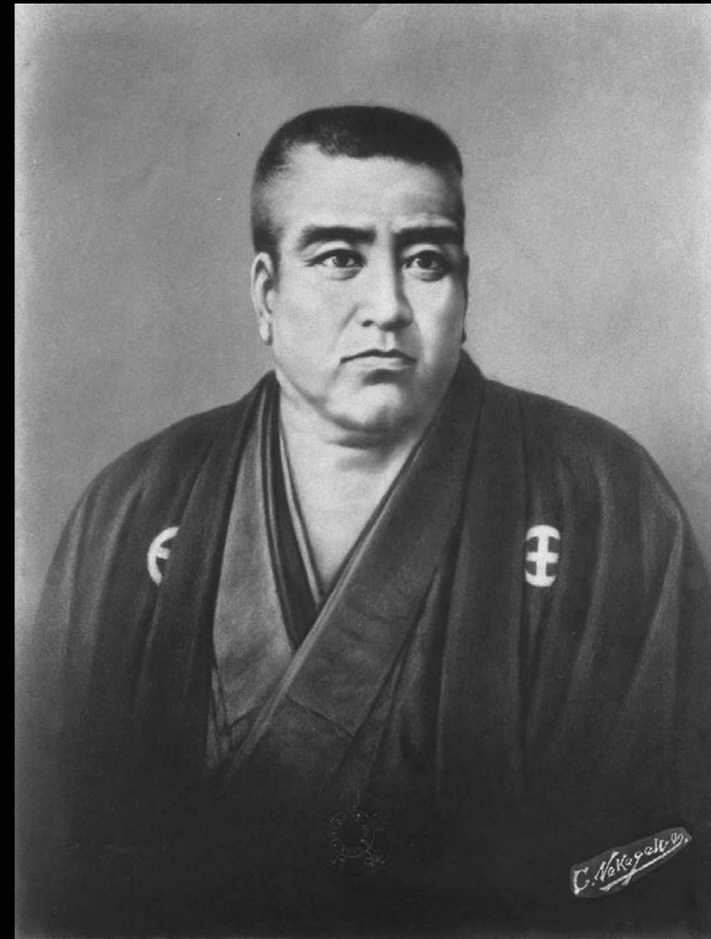
This image is in the public domain. Source: Wikimedia Commons .