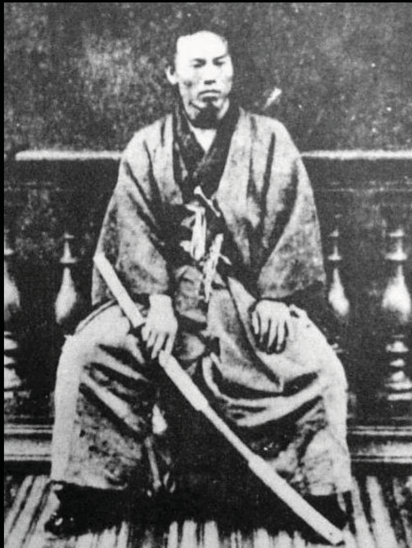
This image is in the public domain. Source: Wikimedia Commons .