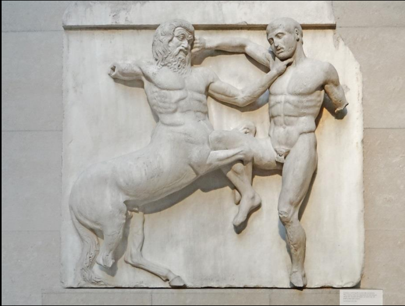
License CC BY.