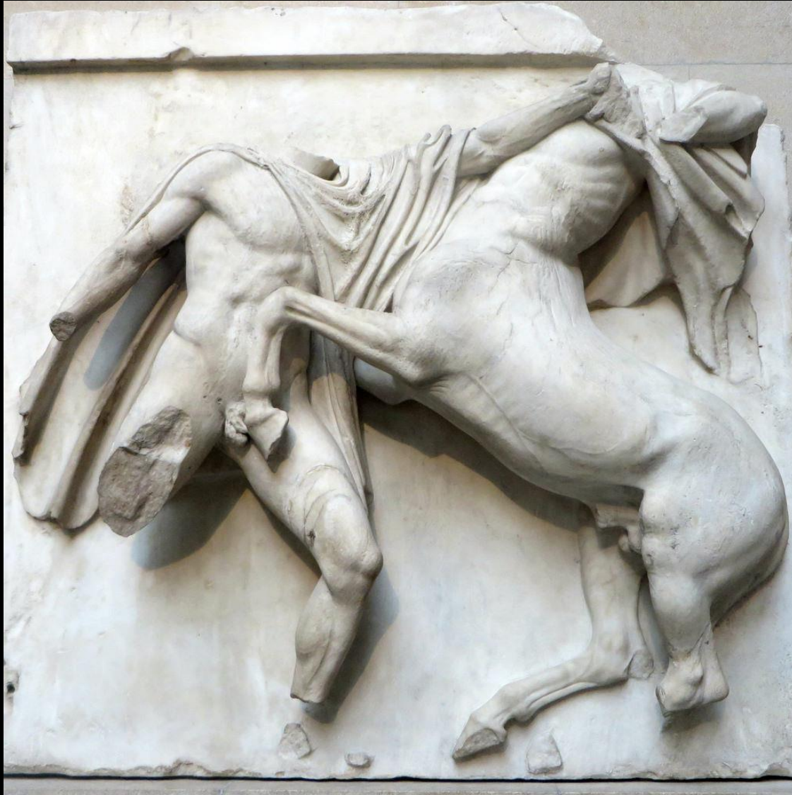
License CC BY.