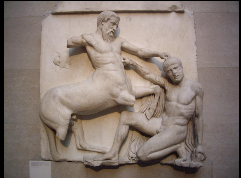
License CC BY.