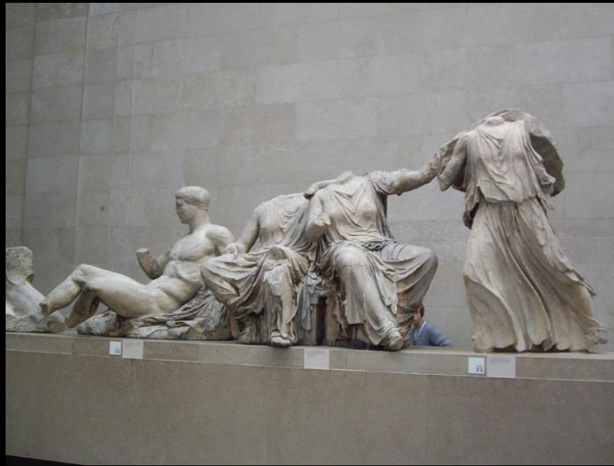
License CC BY.