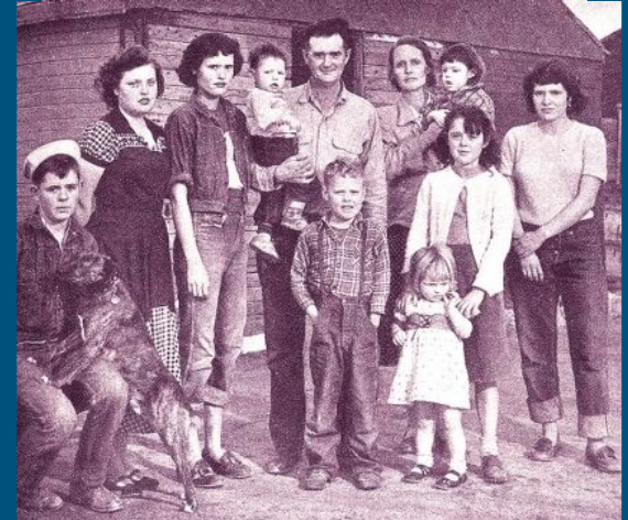
© Pageant Magazine, 1952. All rights reserved. This content is excluded from our Creative Commons license. For more information, see http://ocw.mit.edu/help/faq-fair-use/