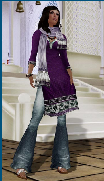
License CC BY-NC-SA.

2014 India: Family court ruled that a wife can file for divorce if her husband does not allow her to wear a kurta and jeans