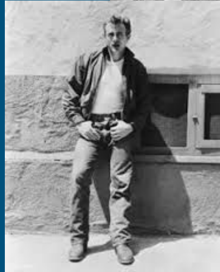
License CC BY.

All rights reserved. This content is excluded from our Creative Commons license. For more information, see http://ocw.mit.edu/help/faq-fair-use