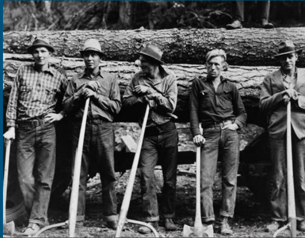
© Dorothea Lange. All rights reserved. This content is excluded from our Creative Commons license. For more information, see http://ocw.mit.edu/help/faq-fair-use/