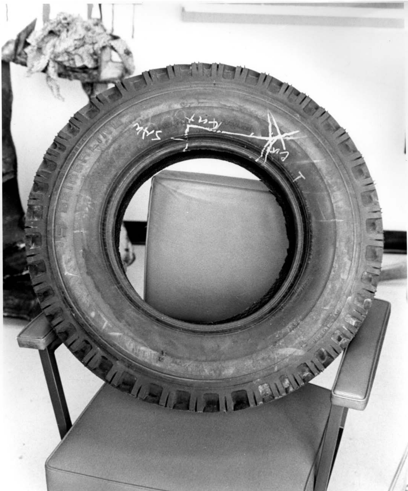
Figure 1: Subject tire, as received.