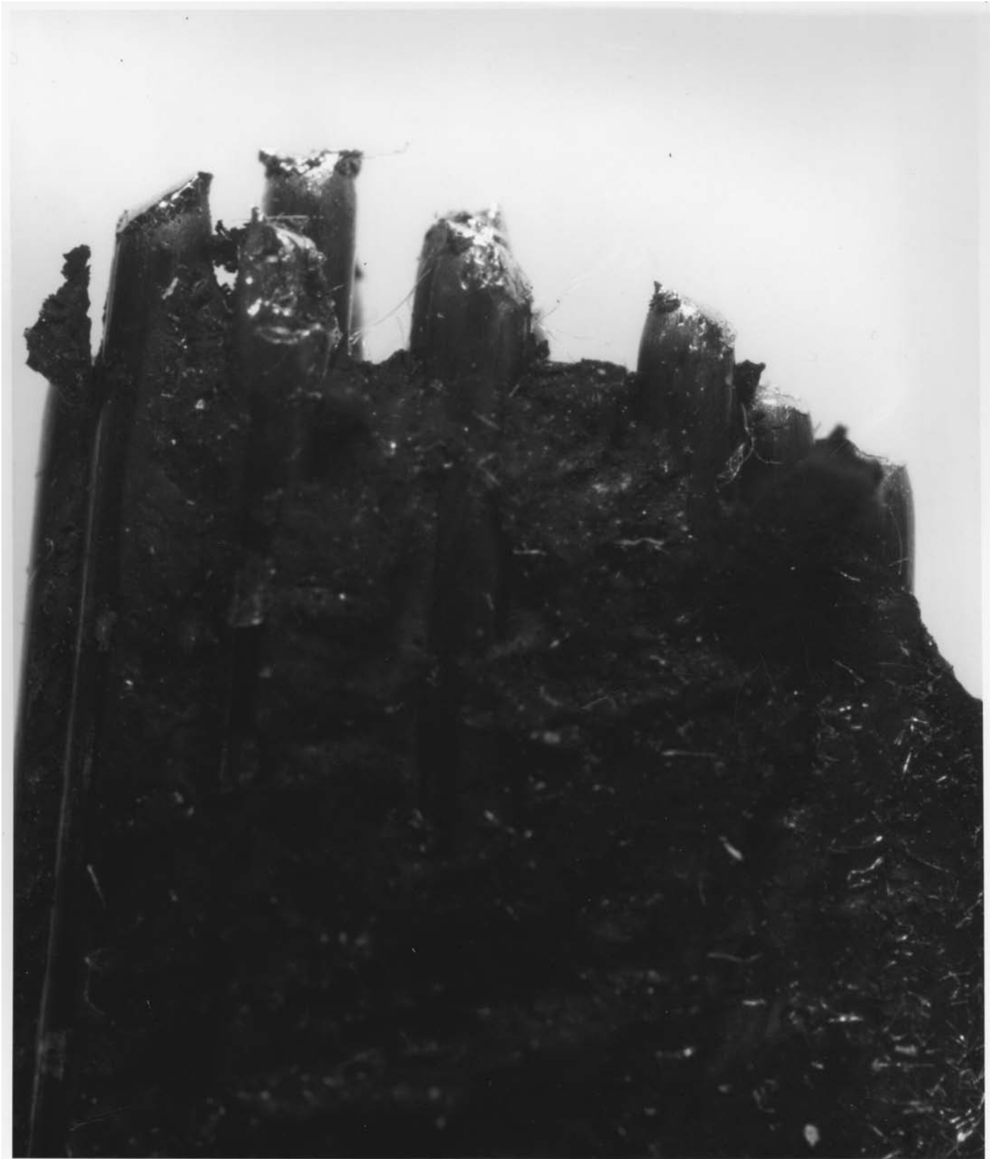
Figure 4: Side view of bead wires, showing ductile fracture.