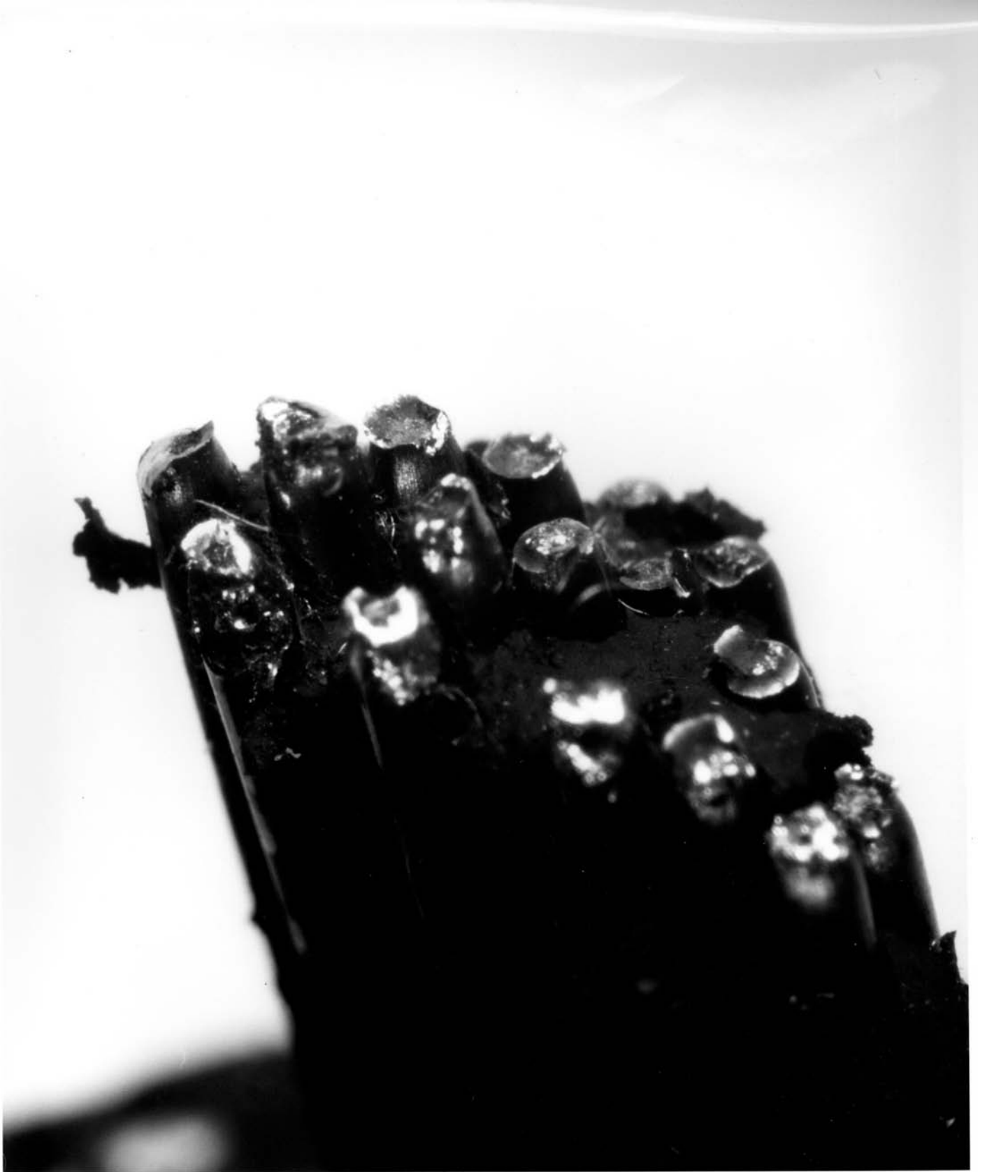
Figure 2: View of bead wires, showing ductile fracture.